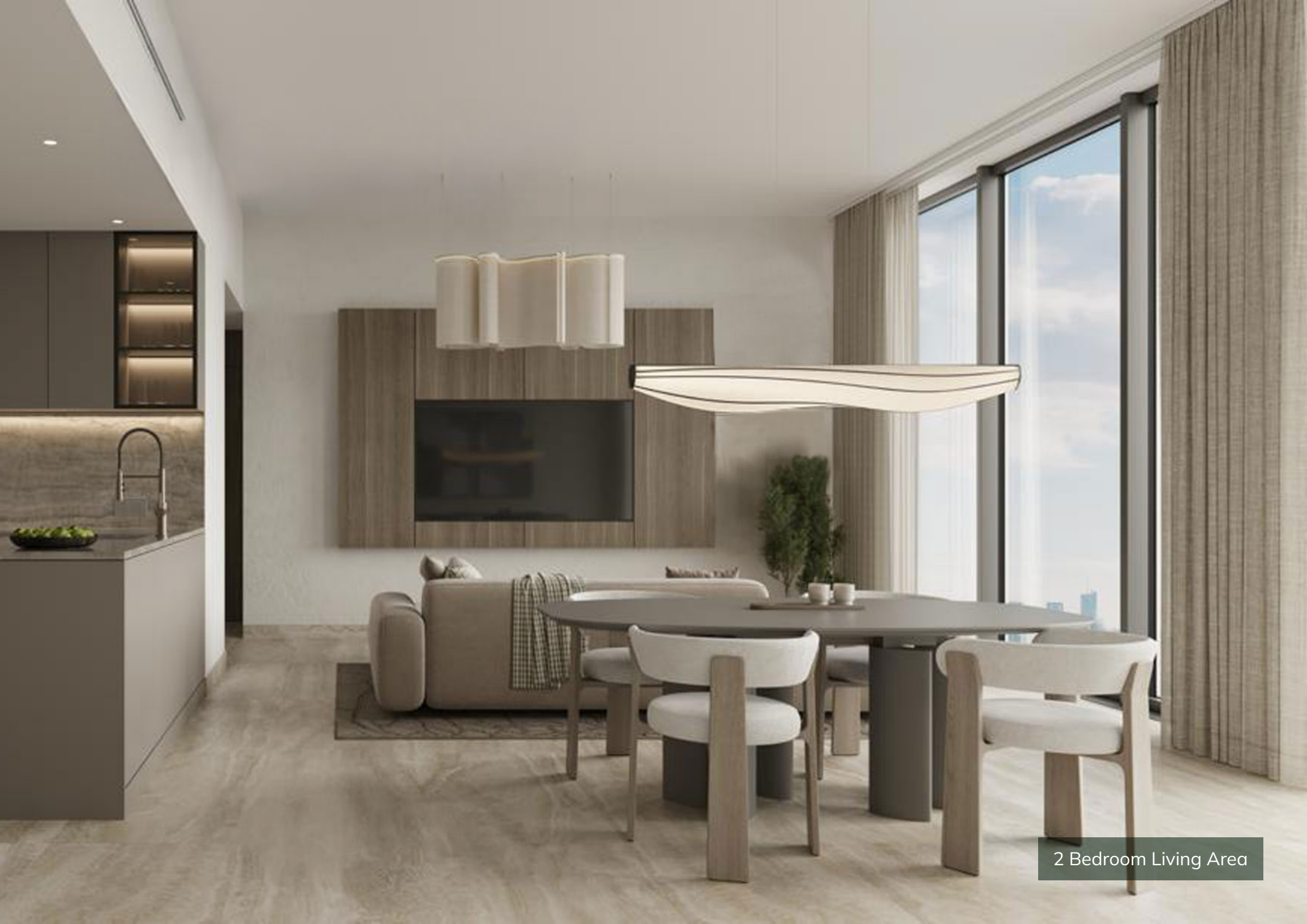
2 Bedroom Living Area