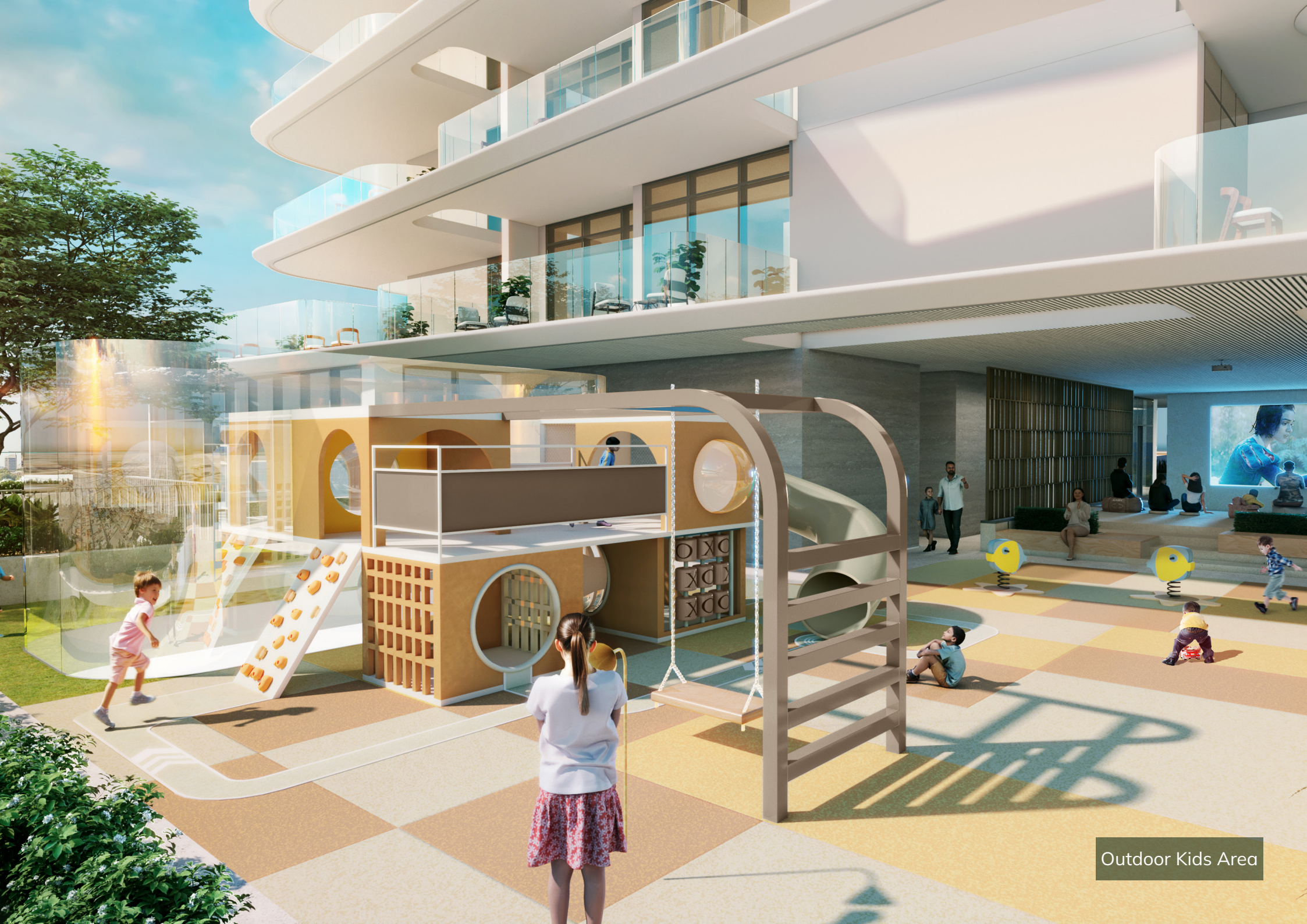
Outdoor Kids Area