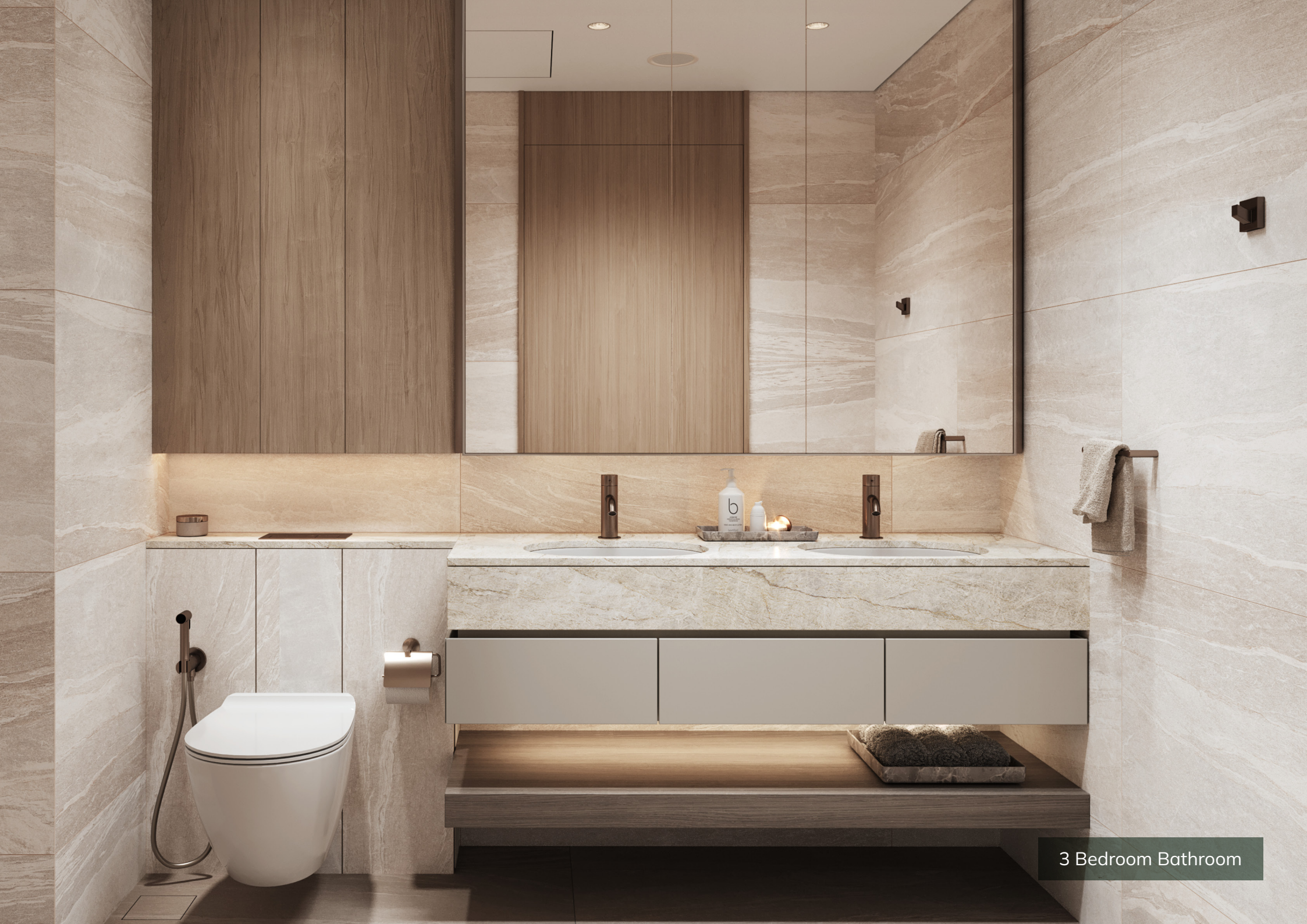
3 Bedroom Bathroom