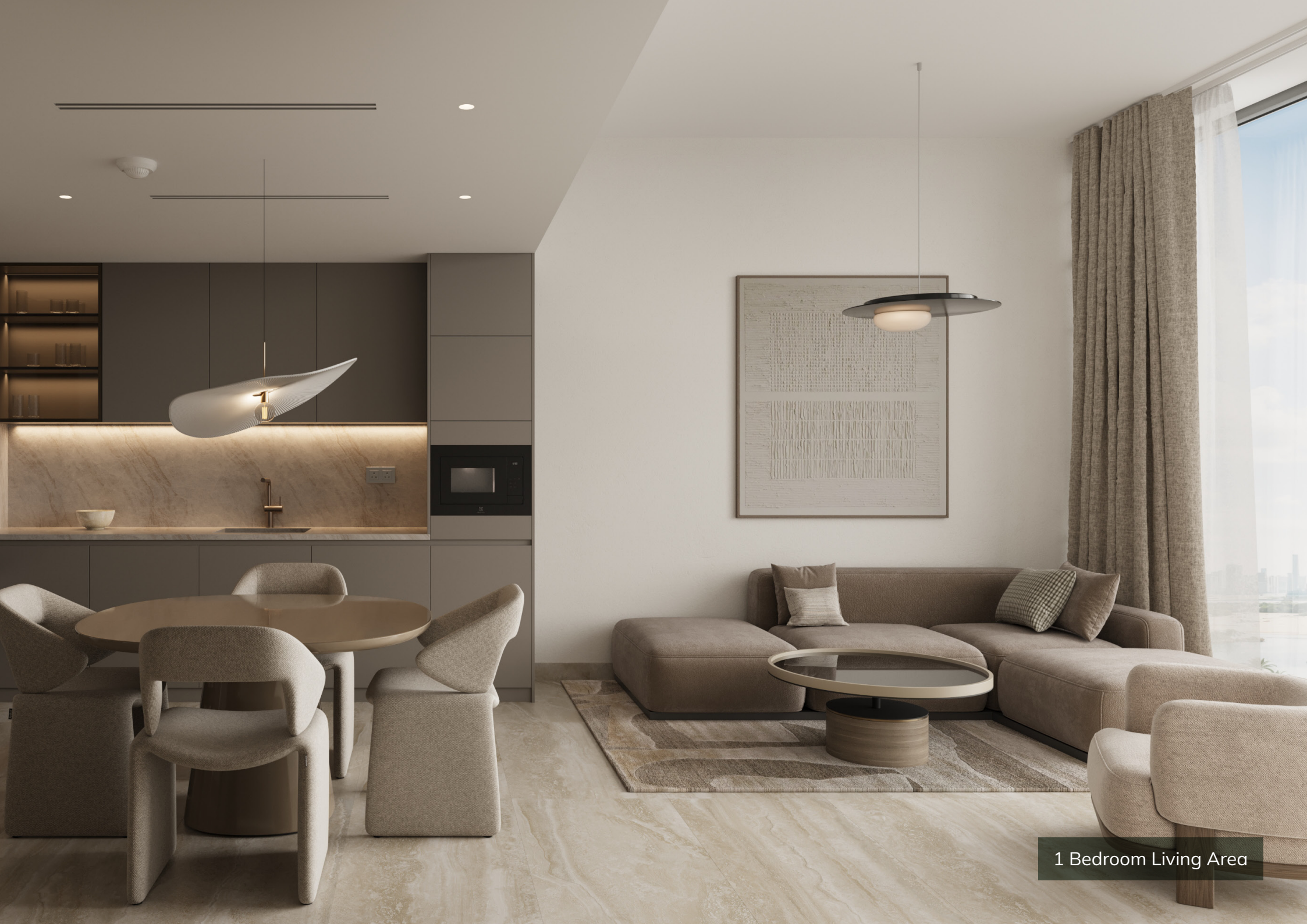
1 Bedroom Living Area