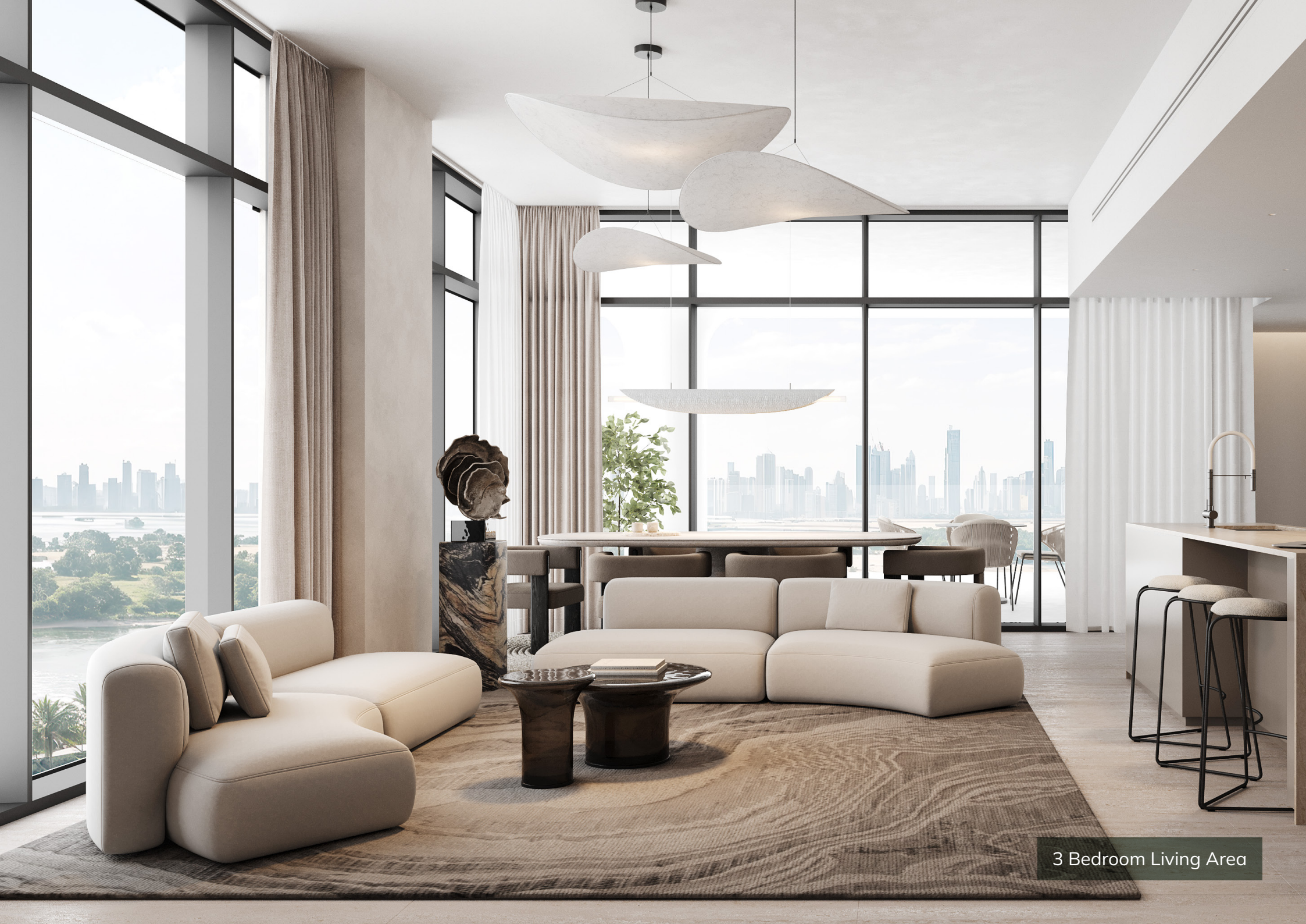
3 Bedroom Living Area