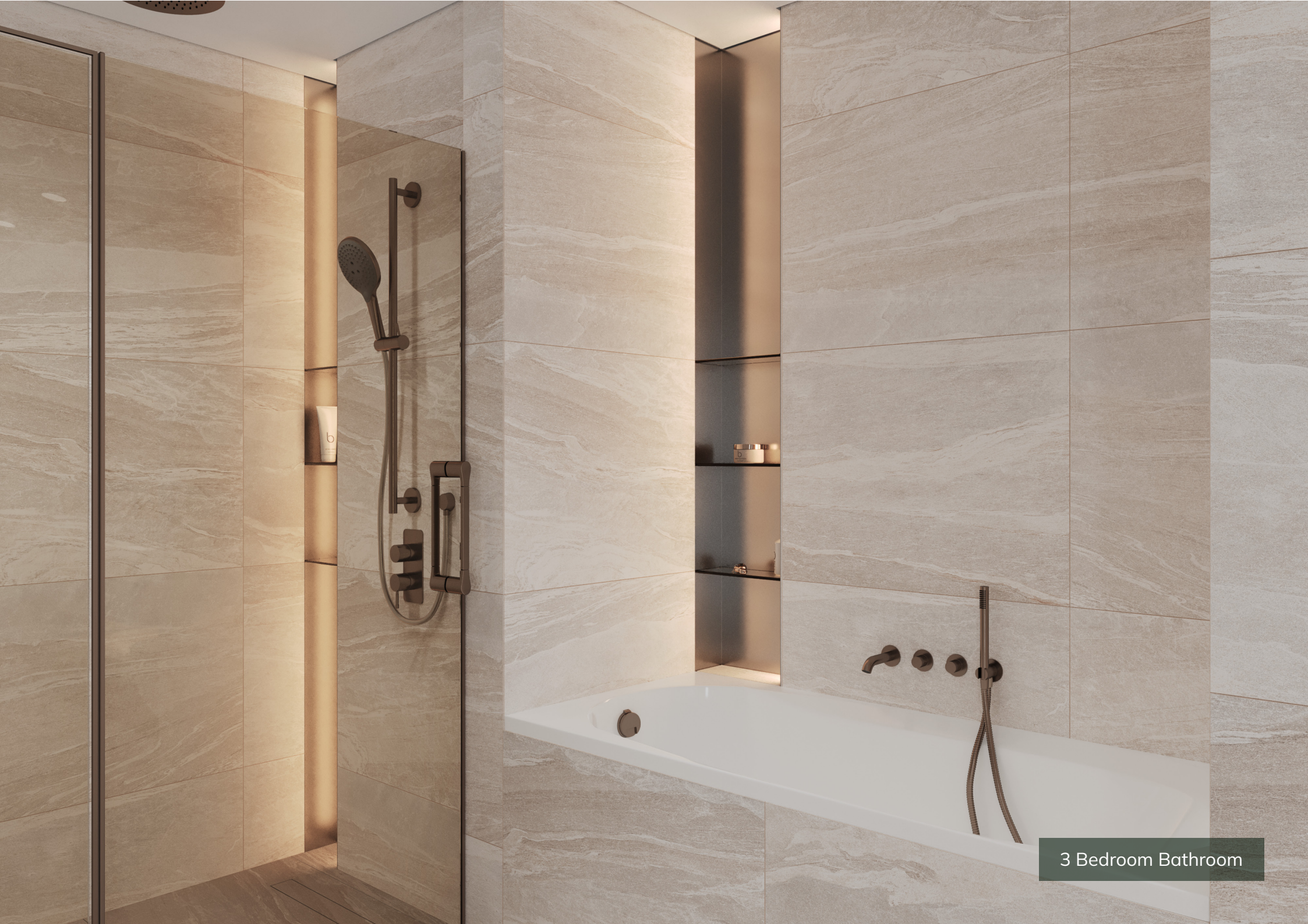
3 Bedroom Bathroom